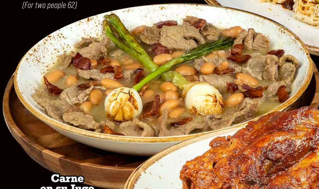
Carne en su Jugo