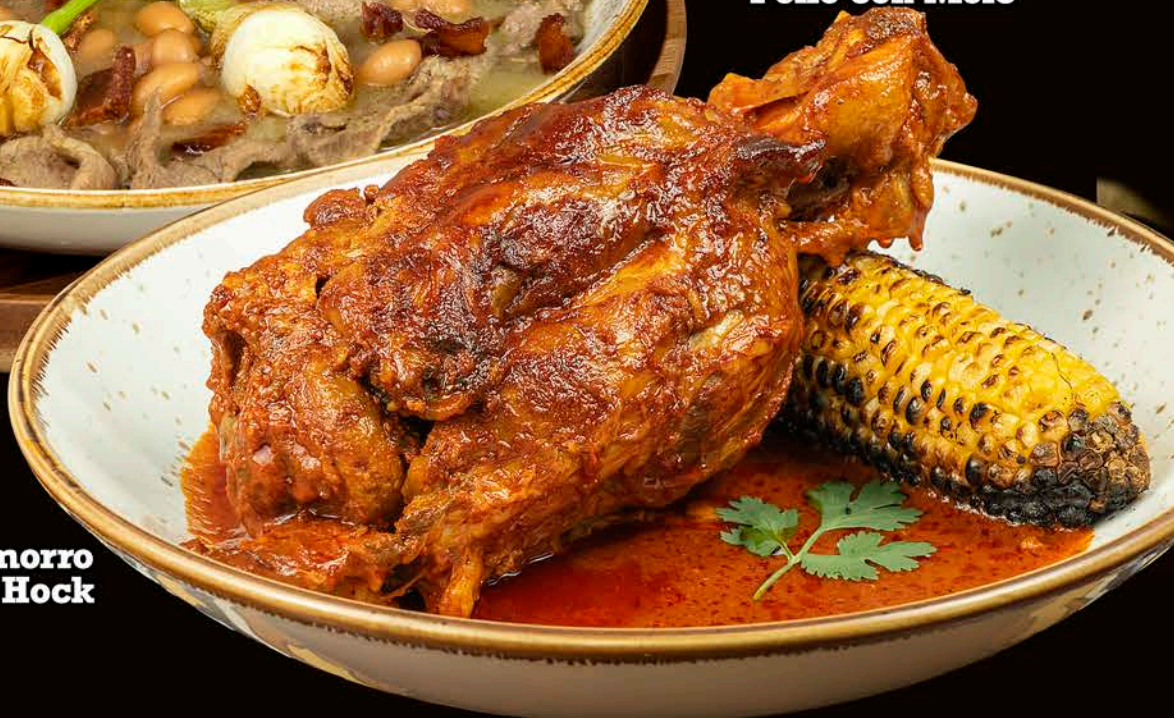
Chamorro Pork Hock