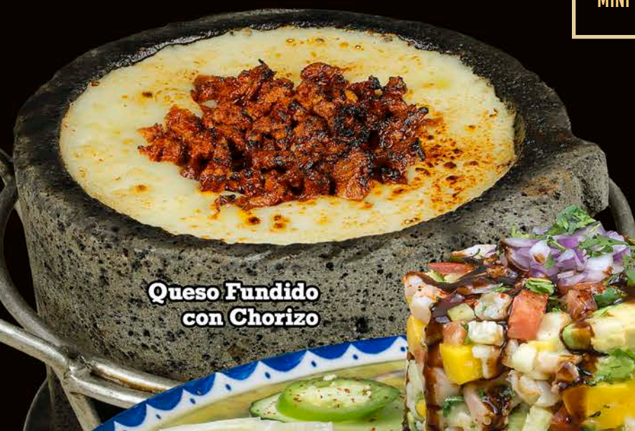
Queso Fundido con Chorizo