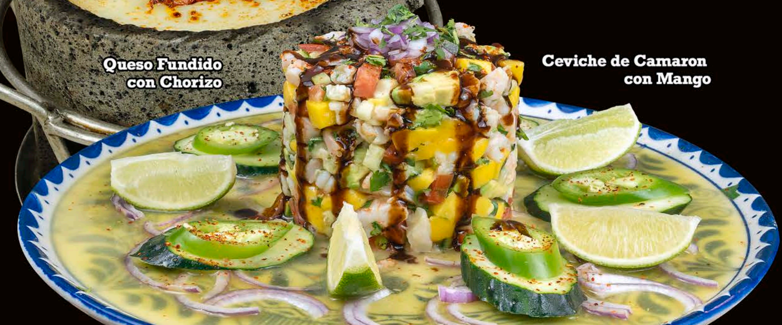
Ceviche de Camaron con Mango