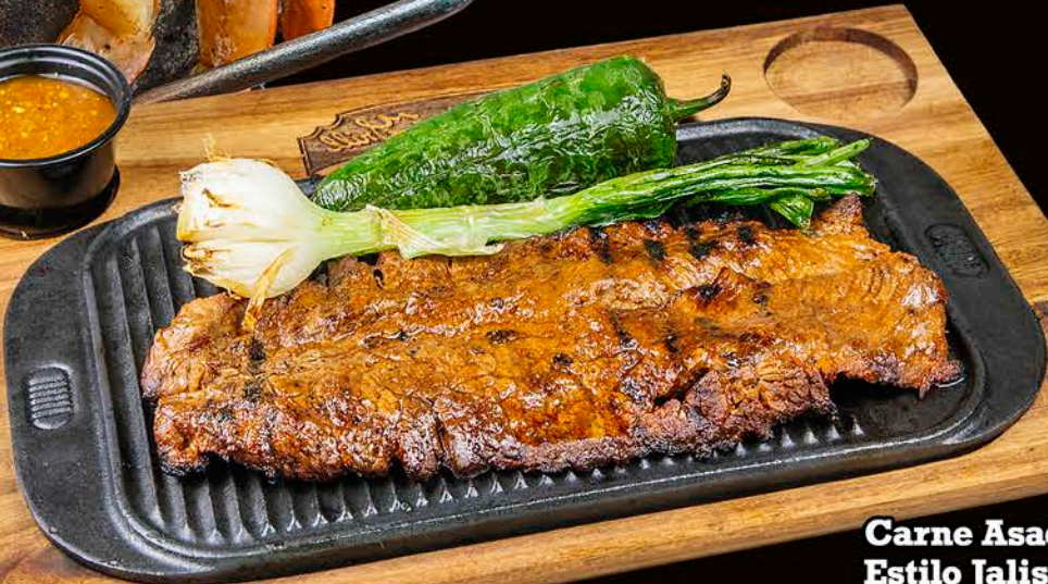
Carne Asada Estilo Jalisco