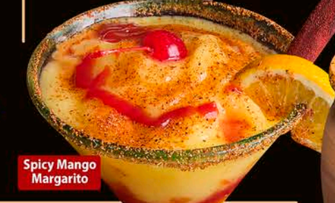
Spicy Mango Margarito