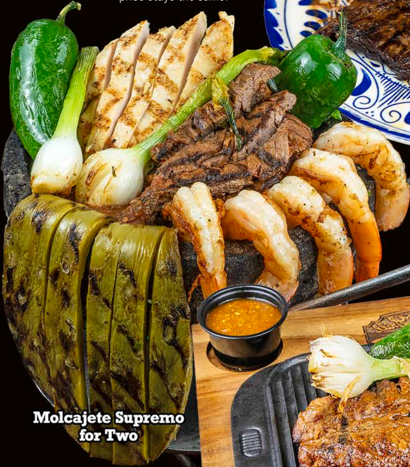
Molcajete Supremo for Two