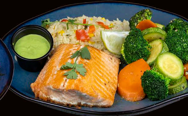
Salmon al Cilantro