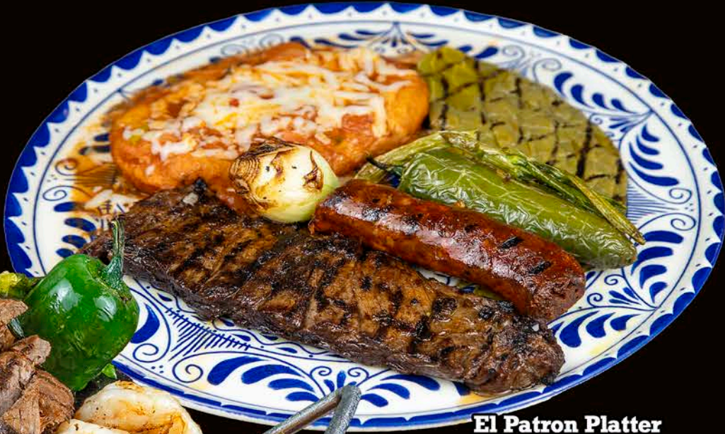
El Patron Platter