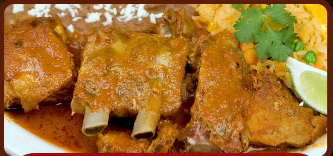
COSTILLA DE PUERCO EN CHIPOTLE