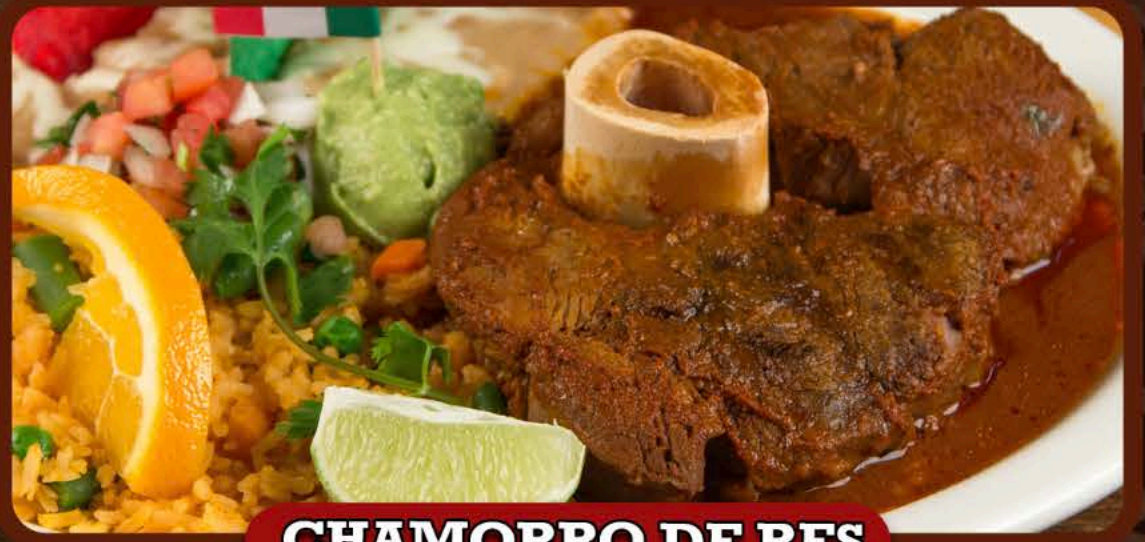
CHAMORRO DE RES