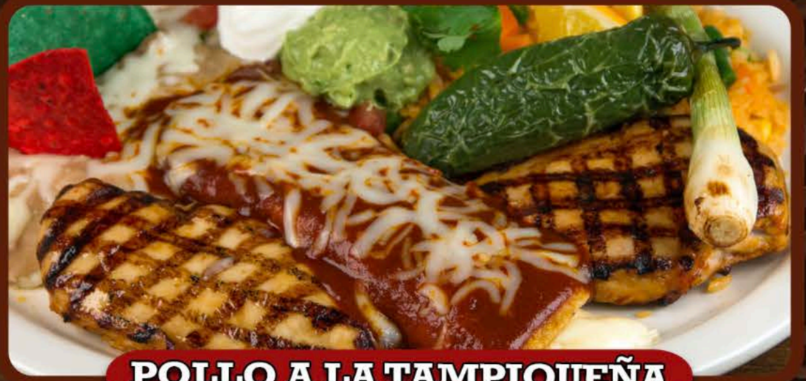
POLLO A LA TAMPIQUEÑA