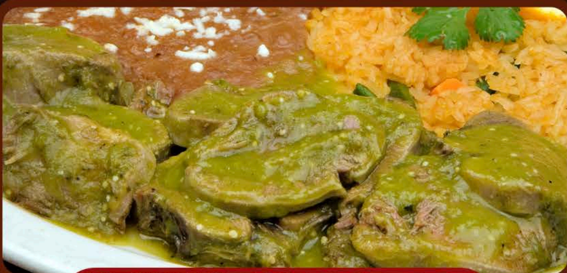
LENGUA EN SALSA VERDE