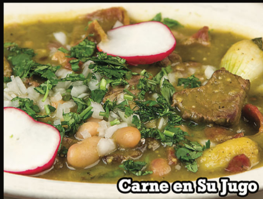
Carne en Su Jugo

Delicious tender beef tongue cooked in our special house tomatillo sauce. $32.99