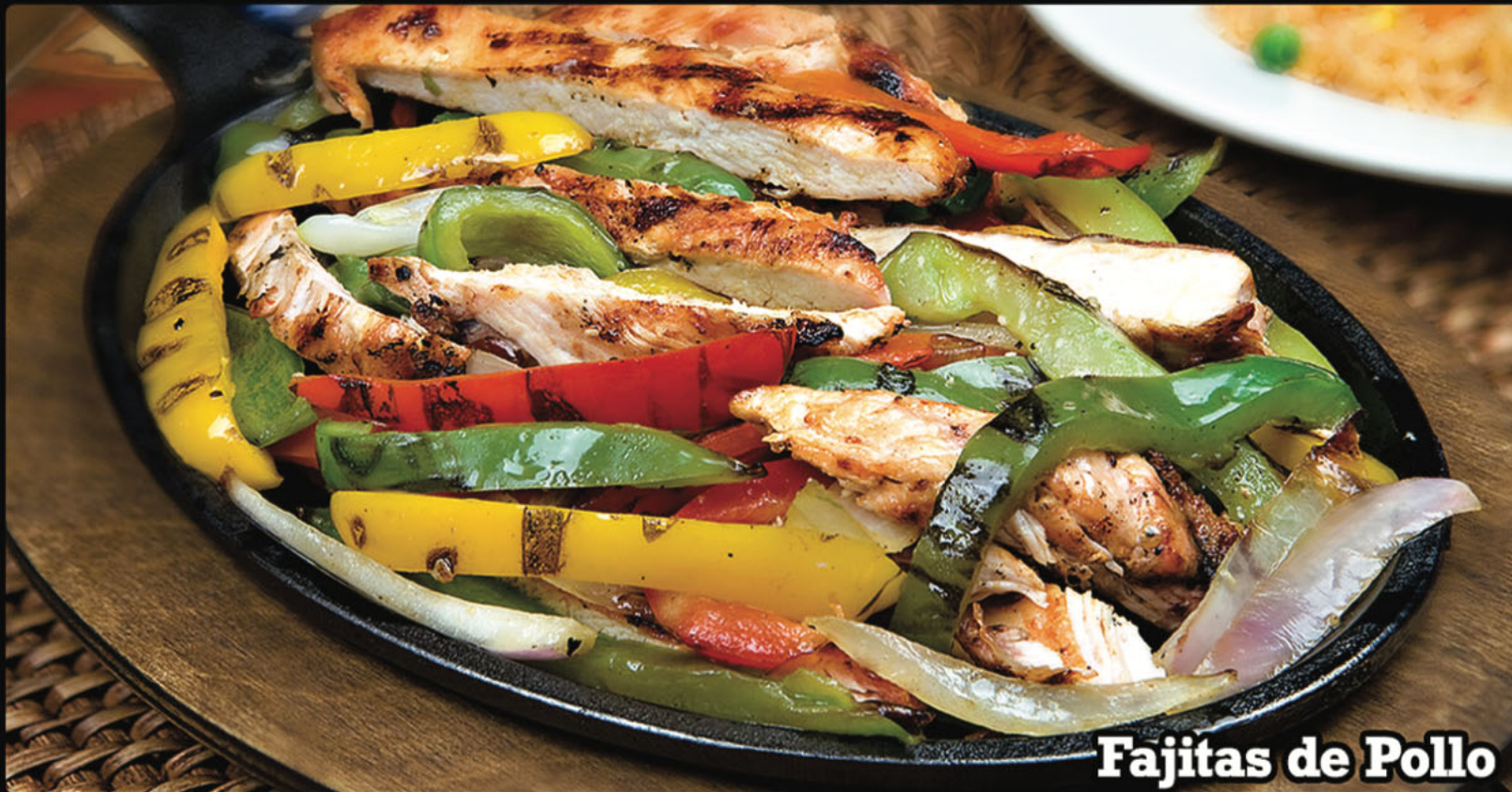
Fajitas de Pollo