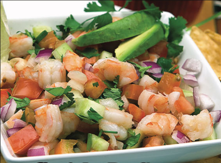
Ceviche De Camaron