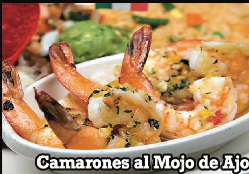
Camarones al Mojo de Ajo

Our finest quality shrimp marinated with our spicy house sauce $32.99