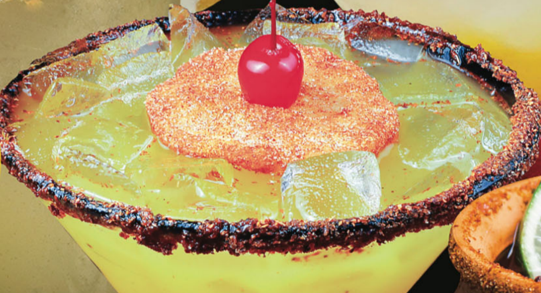
Spicy Pineapple XL