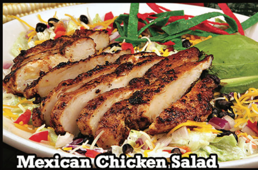
Mexican Chicken Salad

Grilled Salmon served over mixed greens, lettuce, radishes, onions, cucumbers, avocado, queso fresco & house dressing. $30.99