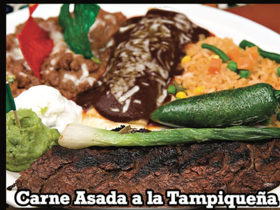
Carne Asada a la Tampiqueña

Delicious traditional carne asada cooked to perfection & paired with a chile pasilla stuffed with cheese, topped with ranchera sauce and melted cheese. $39.99