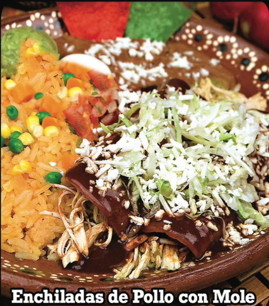
Enchiladas de Pollo con Mole